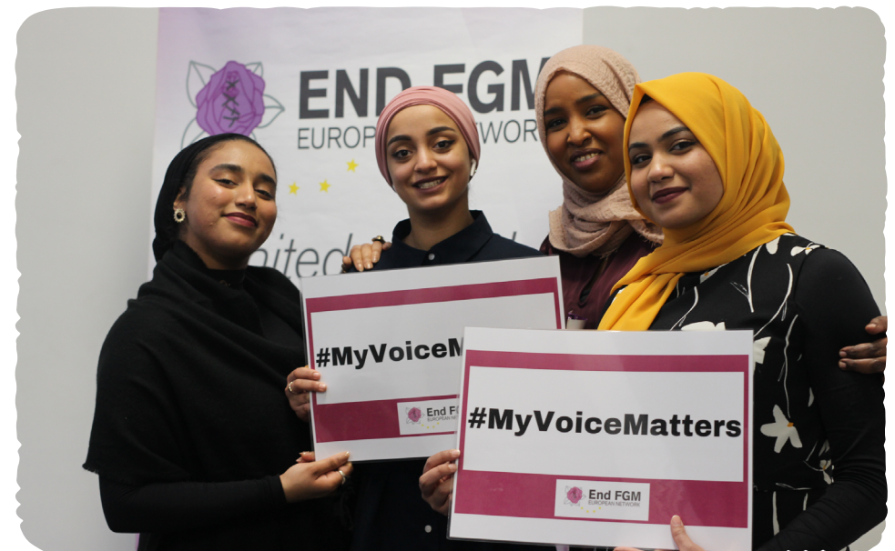
Community activists participating in End FGM EU 2019 annual campaign #MyVoiceMatters* on community engagement at a Multistakeholder event in London, 2019