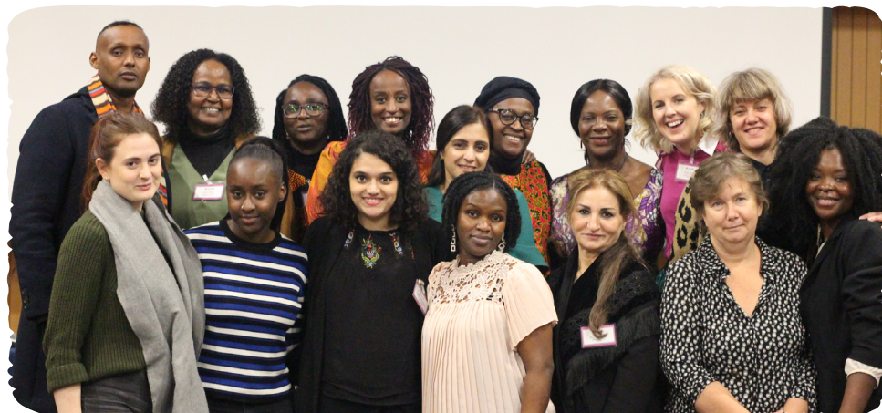
End FGM EU Ambassadors with community activists and representatives from FORWARD UK and End FGM EU at a community engagement conference co-organised by both organisations

However, the involvement of men and boys in supporting and standing by the side of their female counterparts is also key to accelerating the process of FGM abandonment, since without their participation, only one part of the community will be mobilised, which will not be sustainable in the long term. To be effective and inclusive, community engagement must be gender-sensitive as well as age-sensitive, considering the importance of engaging different age groups. Older community members play an important role as respected keepers of the traditions and are therefore key persons to change the narrative around FGM. On the other hand, younger community members are also key stakeholders who may take on the opportunity and responsibility to set the tone around how FGM is perceived in the future. Thus, inter-gender and inter-generational dialogue and cooperation are key to ensure effectiveness of community engagement. And last but not least, it is paramount to engage religious and community leaders , whose authority places them in key positions as social and political influencers.